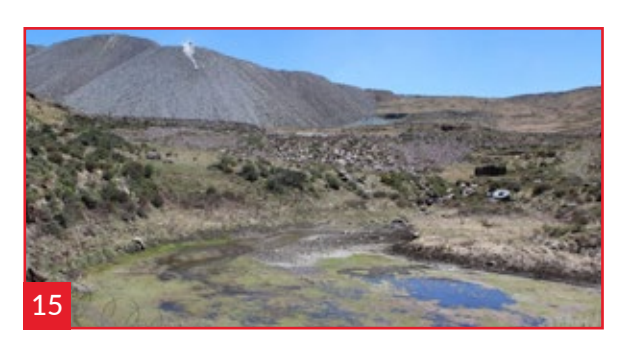
IMAGES 14 and 15 Mine tailings and a dump truck wheel abandoned in a local community water source and later removed and discarded next to source, Maloraneng Valley Wetlands, Mokhotlong, Lesotho 2018